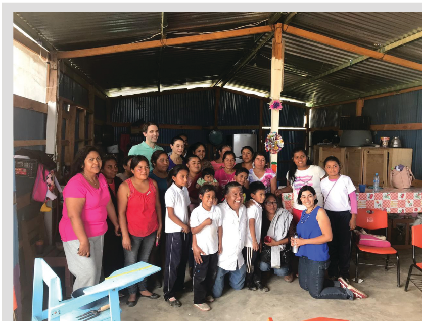
The smiles that say, thank you!