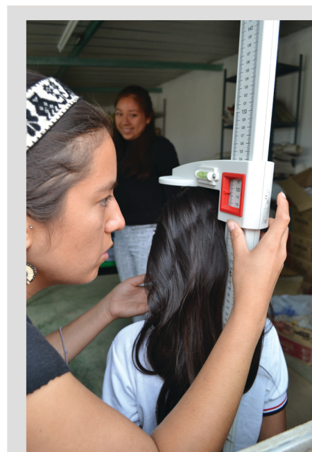
Child nutrition intervention

Children learn and play in nutrition workshops