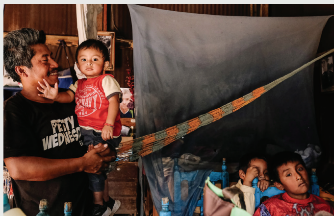
La Clínica's outreach to families and children.

In addition to education, quality health care is also a critical part of a child's life. At La Clínica del Pueblo , the heart and soul of TASH's efforts in Oaxaca, children and their families receive expert care in obstetrics, pediatrics, nutrition, and psychology services at a reduced cost. Though not officially designated a children's hospital, many children come through La Clínica's doors each month and receive quality and compassionate care.