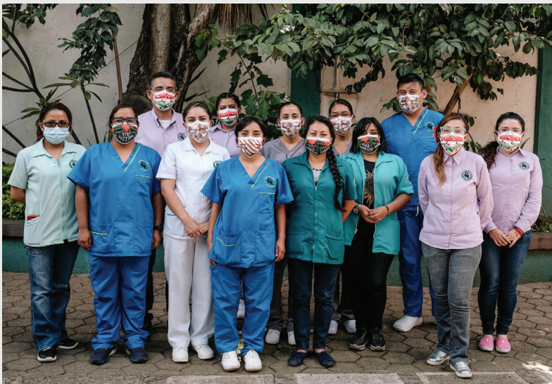
Devoted medical team at La Clínica.

My first visit was a real eye opener. Dust from the dry roads, dirt streets two miles from the Capitol, street vendors, people wanting to wash the front window of your car while waiting at a red light, 10-year-old boys walking around with their shoeshine kits looking for customers.