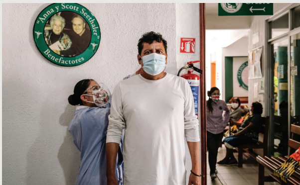
No patient ever left unattended.

Planned Giving: A gift to TASH improves lives. Behind every patient treated are loyal supporters, like you, who make their care possible. Every time an individual enters La Clinica, receives affordable and quality attention, or needs emergency care, your generosity is felt and remembered.