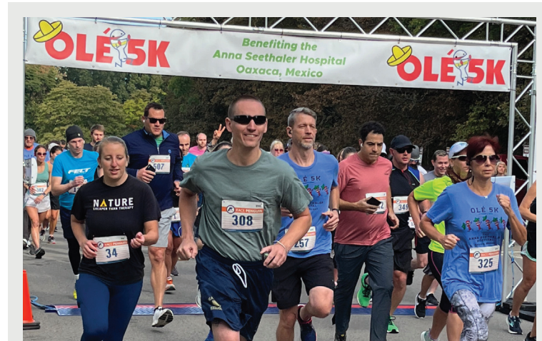
And they are off!